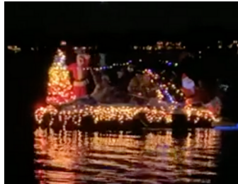
PRESIDENTS AWARD: RAINBOW AND MERMAID