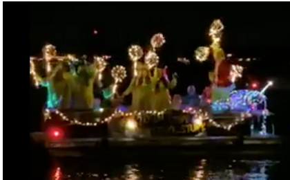
WP ROTARY AWARD: HOW THE GRINCH STOLE CHRISTMAS