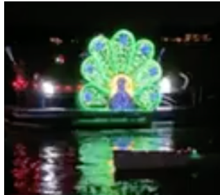
MAYORS WARD: PEACOCK