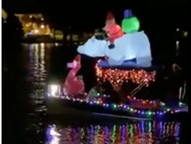
CURLEY BOWMAN: A BEARY MERRY CHRISTMAS