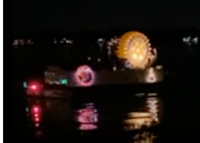
WINTER PARK ROTARY CLUB

As your President, it was my delight to travel Lake Virginia dressed as one of the wise men (how appropriate!) accompanied by nine wine swilling friends with all of us enjoying a perfect night to celebrate the season while navigating the perilous shoals of the Chain of Lakes. If you don't come out and play, others hog all the fun. Find a boat and a few strings of lights and paddle along with the armada in 2021. You don't have to win a prize to be a winner - although I would have felt better if, after all these years, a slice of celebrity came my way for the dramatic renditions of the sorts of things wise men say on the water.