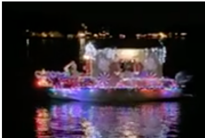
GOVERNOR'S AWARD: GINGERBREAD CHRISTMAS